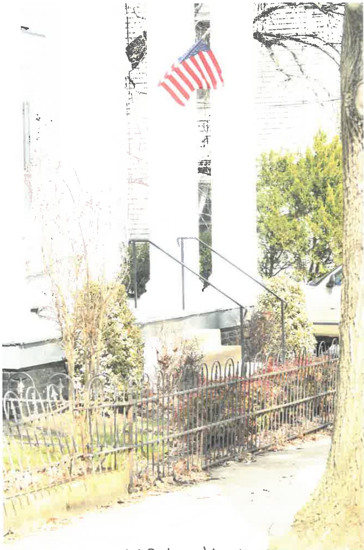
409 Washington St.