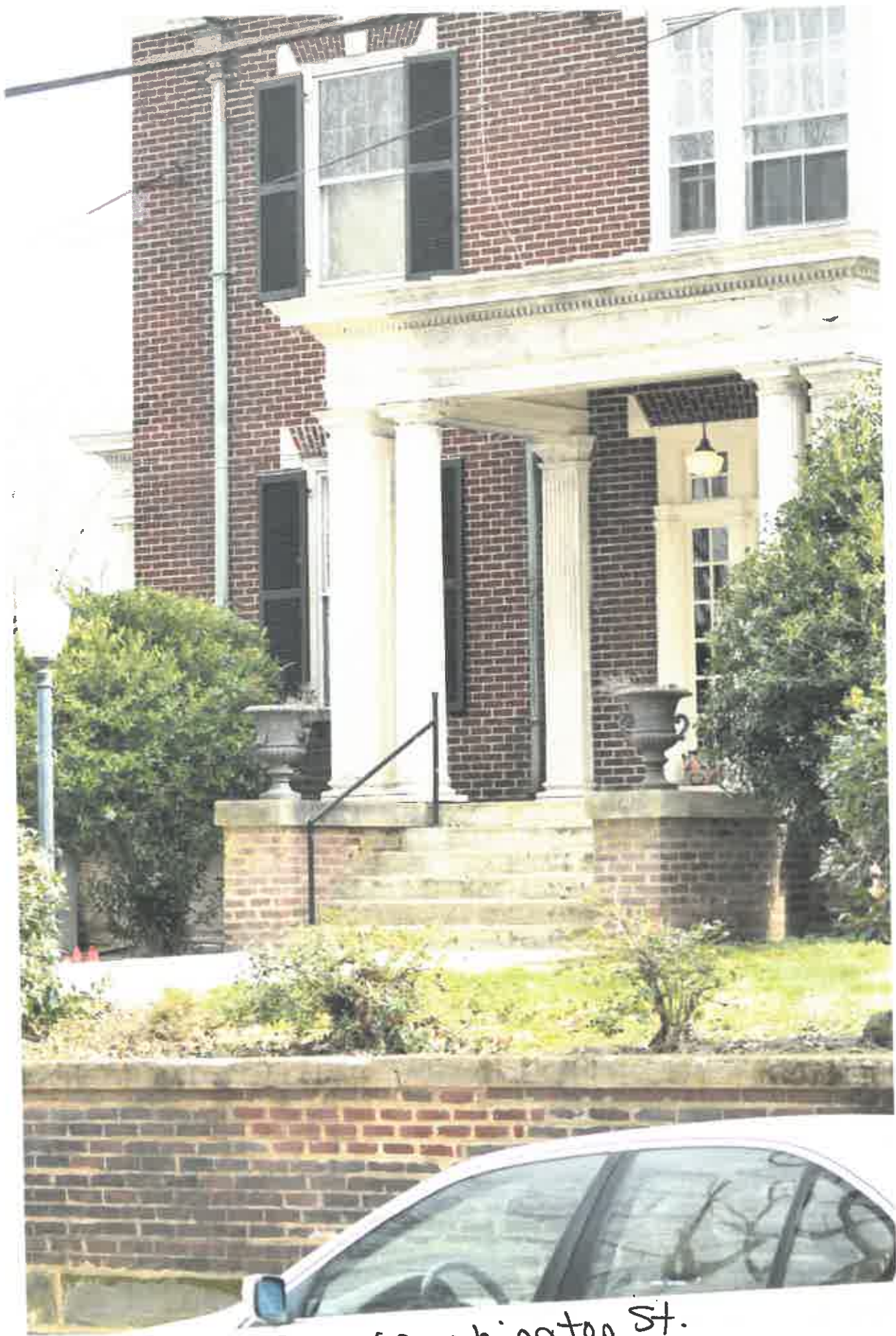
310 Washington St.