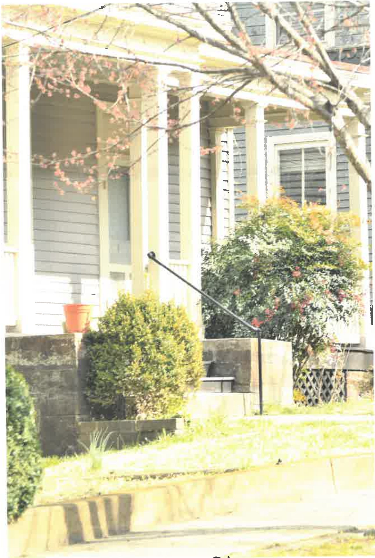
1312 Clay St.