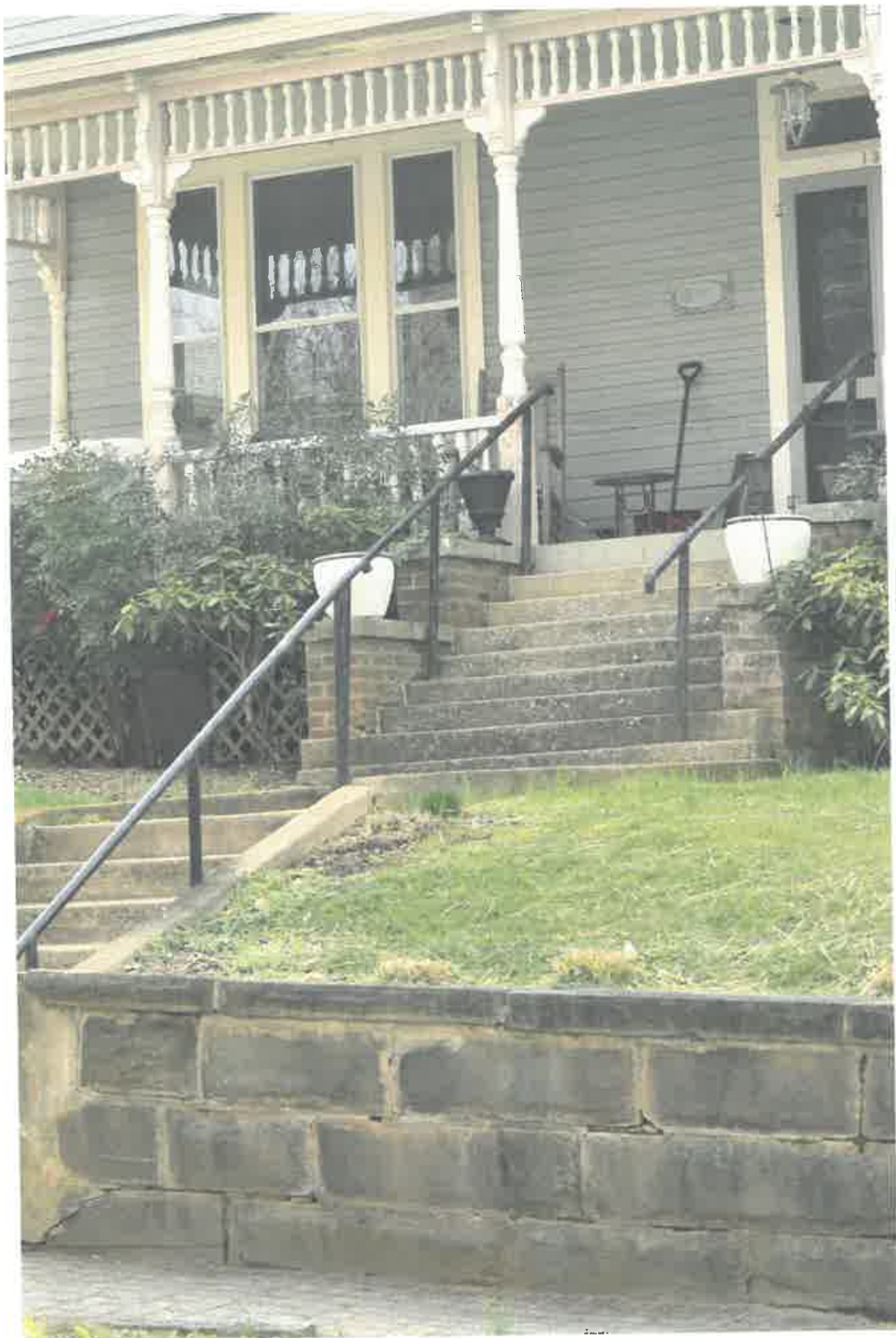
1305 Clay St.